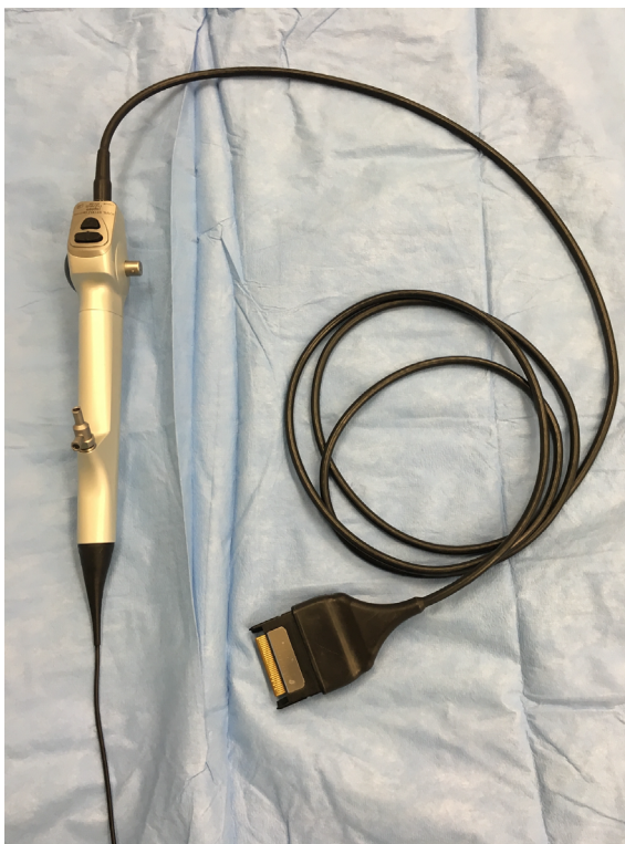
Figure 3 Karl Storz Flex Xc flexible digital ureteroscope.

Digital ureteroscopes possess relatively larger distal tips compared to fiber-optic ureteroscopes. Most current generation digital ureteroscopes have a tip diameter of 7.7–8.7 French, which can be a limiting factor when attempting to access the upper tracts in patients. The BOA and COBRA System (Richard Wolf, Knittlingen, Germany) digital ureteroscopes currently have the smallest tip diameters of 6.6 and 5.2 French, respectively, but there has been no data published commenting on the use of these ureteroscopes in vivo. Several studies have reported the inability to pass