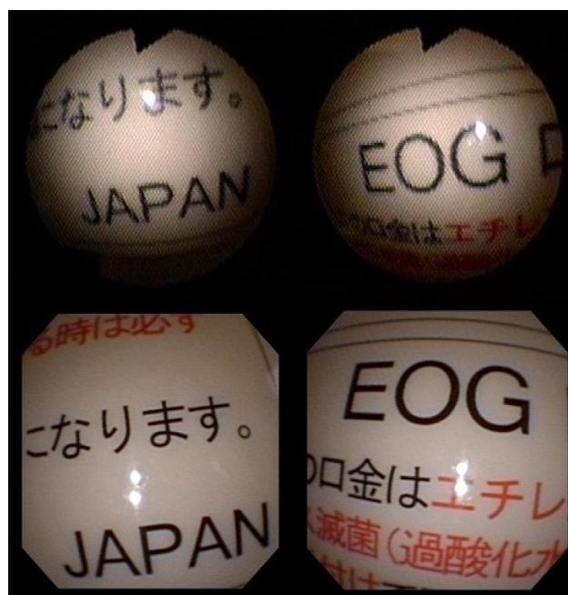
Figure 1 Images from Olympus URF-P5 (fiber-optic) on top, Olympus URF-V (digital) on bottom.

Because digital ureteroscopy utilizes the “chip on the tip” to collect information and relay it to the endoscopy tower, the bulky camera head required for nondigital endoscopic procedures is eliminated (Figure 2). In the author’s experience, the digital ureteroscopes offer improved ergonomics by being lighter and, therefore, easier to handle, something that is especially important during longer procedures where hand fatigue can become an issue. Furthermore, the reduction in scope cords from two (camera and light cord) to one helps to prevent cord entanglement and reduces clutter in the operative field. The combined cord and the elimination